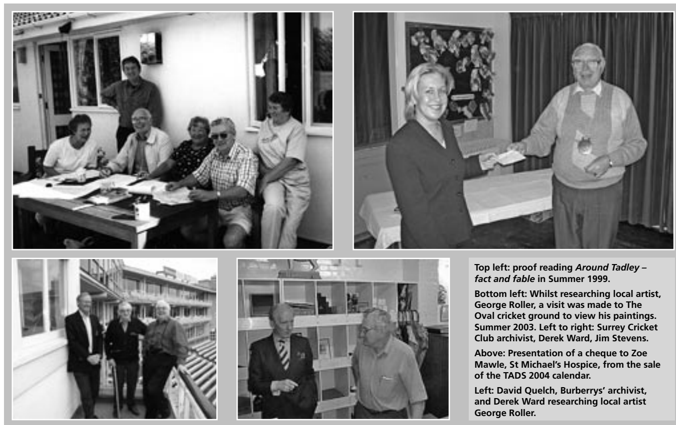
Top left: proof reading Around Tadley – fact and fable in Summer 1999.

In addition to the monthly talks held at St Paul's Hall, The Green, TADS has a very active project group which meets regularly to discuss and consolidate the research for current and long term projects. It is not always as dry and studious as it may sound. A few glasses of wine or beer have been known to pass lips!!